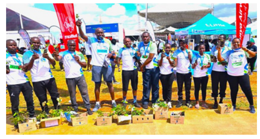
Universities Fund team during the Standard Chartered Marathon in Nairobi on October 29, 2023

The competition started at 5.45am along the Southern Bypass and terminated at Uhuru Gardens.